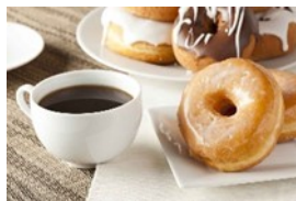
Coffee and Donuts today (Sunday) in the school building

The Region 7 bulletins are available on our website, www.emmanuelcatholic.com/bulletins/ . Archived bulletins may be found by clicking on the Bulletin Archive link. Keep informed on the happenings within our Downtown Dayton Catholic Parishes.