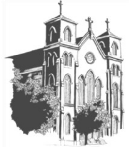
Emmanuel Church 1837