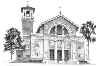
St. Joseph Church 1847